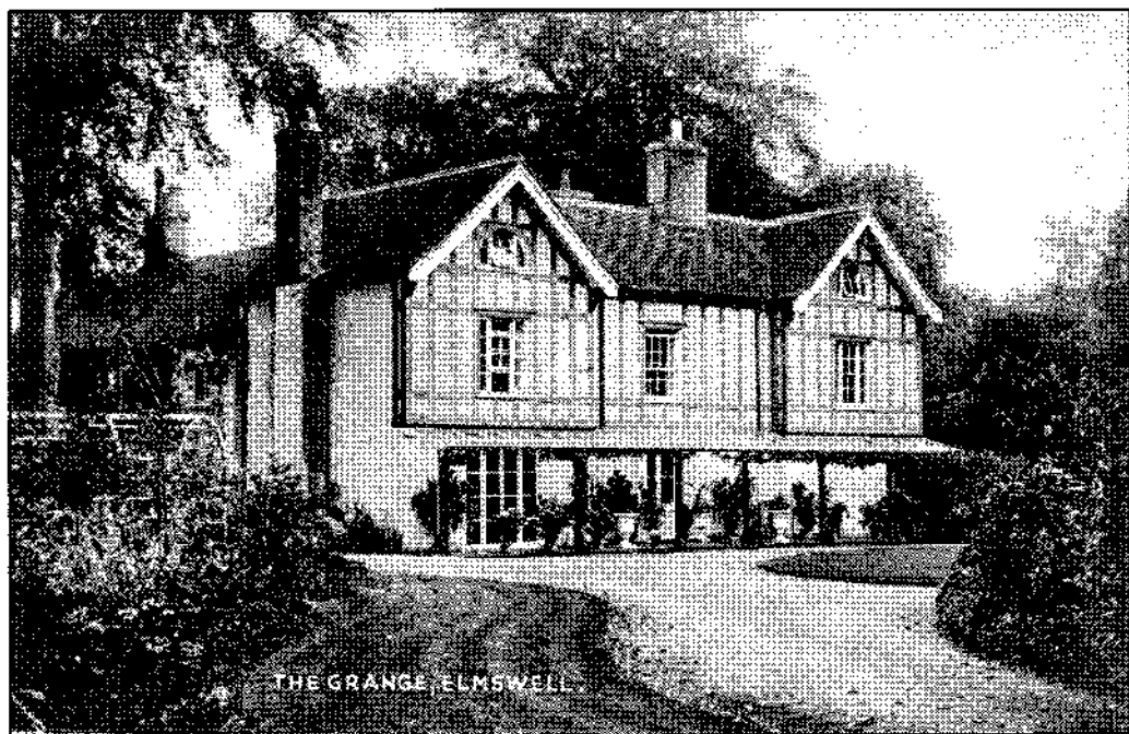
THE GRANGE, ELMSWELL

The GRANGE .... formerly the Rectory - see page 19.